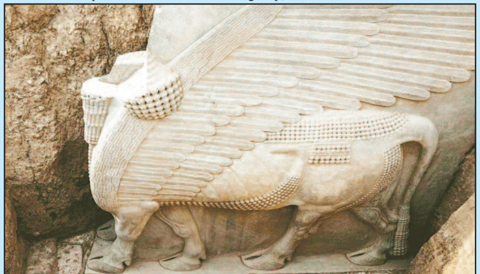
A view of a sculpture erected to provide protection at the gates of the ancient city of Khorsabad.

It was during this period that looters pillaged the head and chopped it into pieces to smuggle abroad. The rest of the relief was spared the destruction wreaked by the Islamic State jihadist group, which overran the area in 2014.