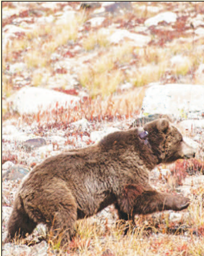
A brown bear roams the Deosai National Park after a GPS collar was fixed to it.