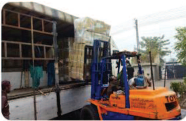
OUR FTL SERVICES COVERS