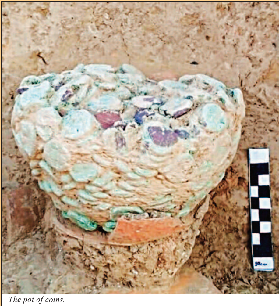
The pot of coins.

'Although subsequent investigations suggest a break between the end of the Indus occupation and the Kushan phase, it is unlikely that the site was ever totally abandoned due to its high position on the plane and the protection it afforded against floods,' he said.