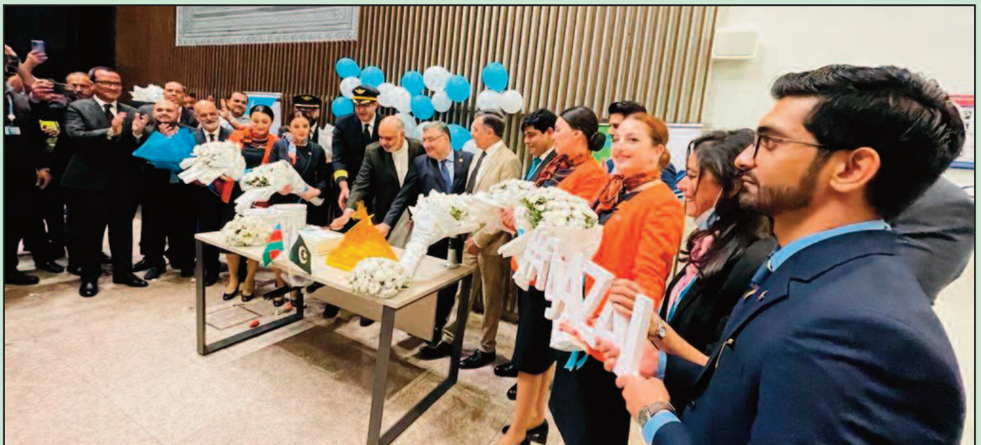
Azerbaijan Airlines (AZAL) starts flight from Baku to Islamabad, photo shows cake cutting ceremony held at Islamabad International Airport.

The aircraft (reg. G-ZBKH) landed back on runway 27R 1 hour and 54 minutes after takeoff.