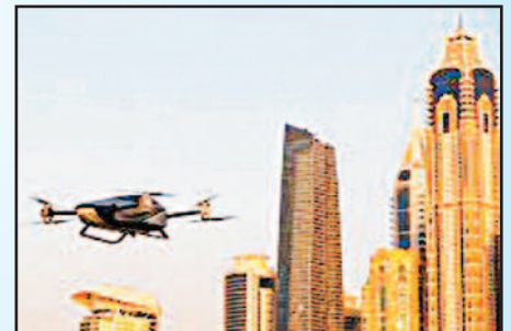
A Chinese 'Flying Car' makes its first flight in Dubai.

'We expect the demand to be more than we can even handle. The pricing