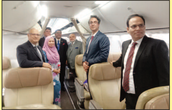
The officials were photographed inside Batik Air B-737-800 aircraft.