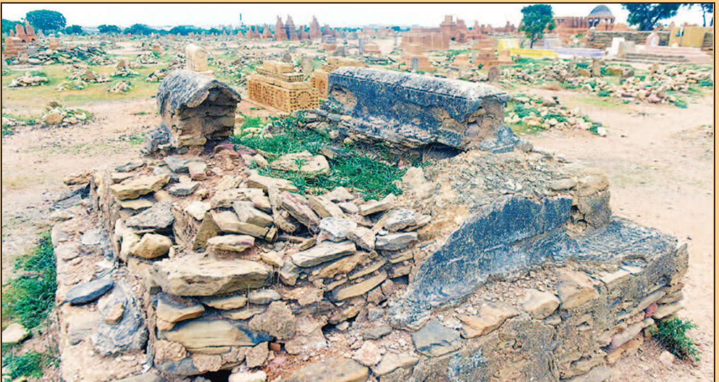
A damaged grave in the Chaukhandi graveyard.

The chief minister directed the commissioner to remove the illegal parking of heavy trucks adjacent to the main entrance (boundary wall) of the graveyard. He directed the deputy commissioner of Malir and the solid waste management board not to allow dump-