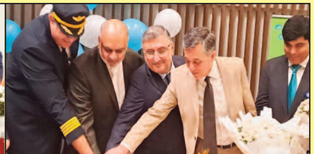
Azerbaijan Airlines (AZAL) starts flights from Baku to Islamabad, The photo shows a cake cutting ceremony held at Islamabad International Airport