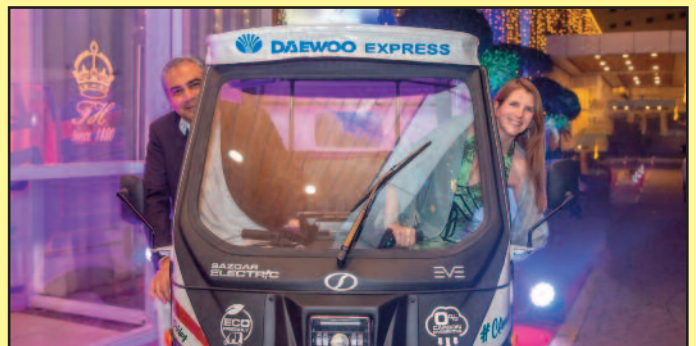
Daewoo Pakistan Express Bus Service launches Electric Rickshaw, picture shows Mr. Mohsin Naqvi, Caretaker Chief Minister of Punjab and British Dy. High commissioner, Lahore ride into it in a function in Lahore .