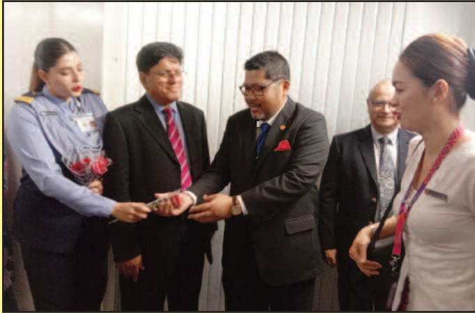
The Consul General of Malaysia is being presented with a flower.