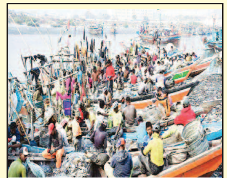
Fishermen prepare to unload their catch after they arrived at a city harbor on Nov. 21 on the eve of World Fisheries Day.

When moneyed Hindus and landed Sikhs fled this part of the Punjab, they left behind huge assets and properties which were up for grab. And the powerful in the new state grabbed all and everything without sanction of law. All who had the muscle presented their claims based on lies to appropriate the evacuees' properties and assets. So much so that migrants from cities of Uttar Pradesh became landlords in Pakistan. A new class of the people, close to the state and its powerful bureaucracy, was born from the womb of what we know as 'claims' which were mostly false i.e. lies. The concepts of legitimate rights, honest work and rule of law were deliberately put on the back burner. Power or an arrogant sense of entitlement expressed in social life was the short cut that renegeted a desperate desire for self-advancement. Individual gain by foul means became an accepted means for the achievement of social ambitions. Sadly, we forget that we are now metaphorically an epitome of what Jesus Christ said in the Gospel: '...they that take the sword shall perish with the sword.'