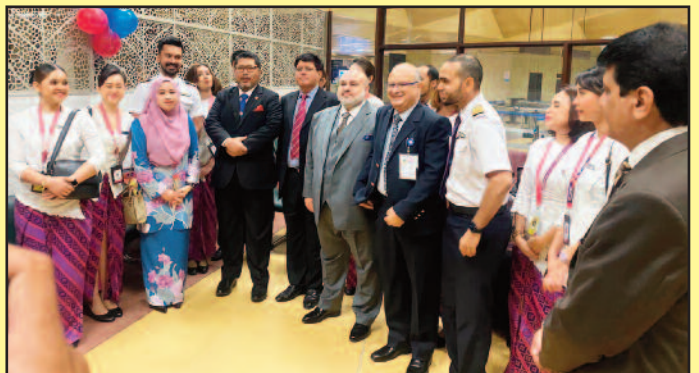
Group photo with crew of Batik Air.