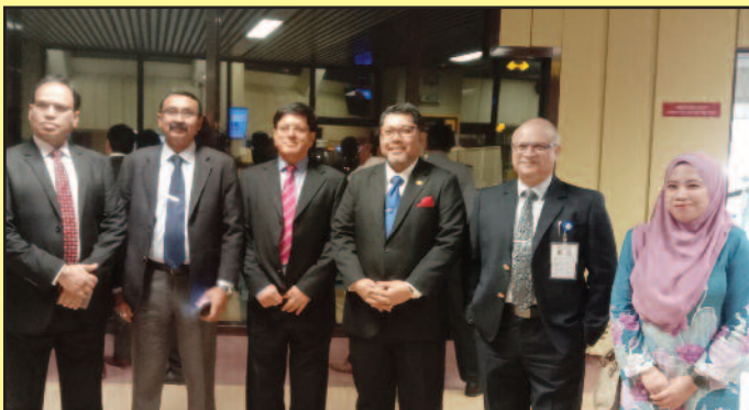
Group photo with the Consul General of Malaysia, Karachi.