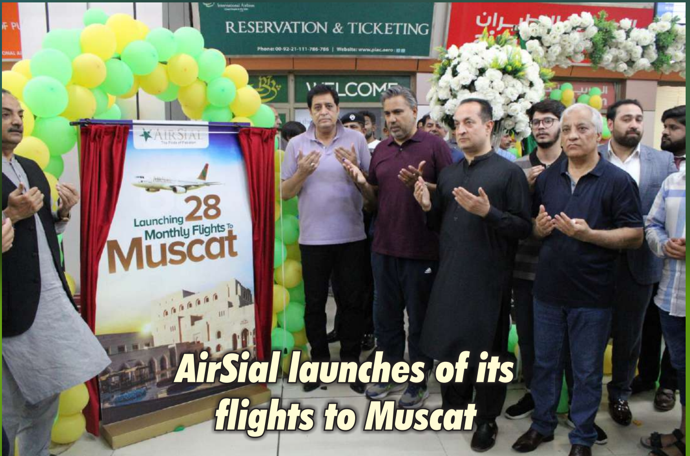
AirSial launches of its flights to Muscat