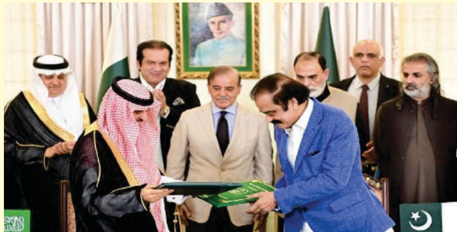
Prime Minister Shahbaz Sharif witnesses the signing of the ‘Road to Makkah’ project agreement between Saudi Arabia and Pakistan on Wednesday 17th May.

Following the ceremony, the prime minister presented a souvenir to the Saudi dignitary, who also reciprocated the gesture by presenting a memento to Mr Sharif.