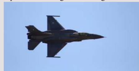
A Turkish Air Force Lockheed Martin F16 Fighting Falcon

President Biden don't confirm which F16 models or how many western countries would send but they are expected to be older F16 C models which the US will replace with new generation fighters.