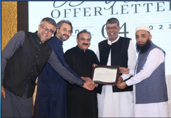
HOAP Sindh distributes 5 years offer letter