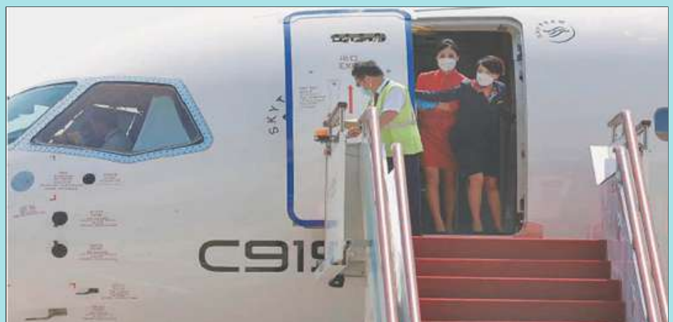
Crew members check before the first commercial flights of passenger jet C919 from Shanghai's Hongqiao Airport, on Sunday 28 May.

One of the Southwest pilots unlocked the door from a Flight Deck window, and the flight departed as scheduled.