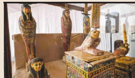
OBJECTS are display at the Saqqara necropolis where archaeologists unearthed two human and animal embalming workshops as well as two tombs.