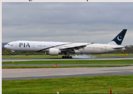
For a second time, a PIA Boeing 777 has been seized by Malaysian Authorities at Kuala Lumpur airport.

In January 2021, another Boeing 777 was held back for two weeks over a case involving $14 million in unpaid dues.