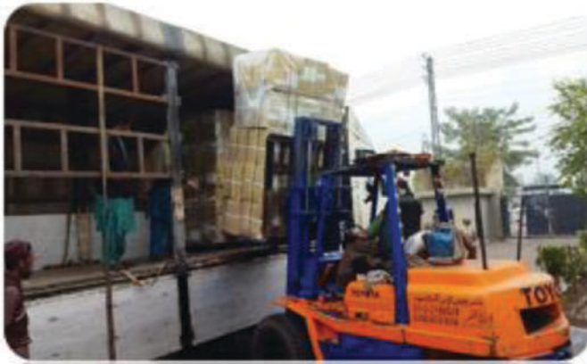
OUR FTL SERVICES COVERS