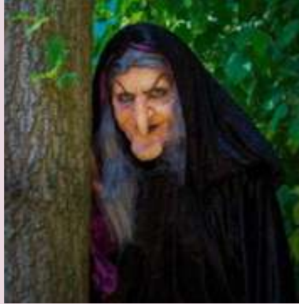
(A witch does not heal' it just eats Kaleja-liver ,lungs, heart, stomach etc, (She can't be a wife) & (A caring woman healer, can be a nurse or a wife)

But one of the law enforcers apparently as allowed by the administration came out to show his chauvinism to her, dragged her by her hair and pulled her across the road; towards the rank and file, in a mob of males predominantly. Some men protesting on the other end ran to her rescue and thankfully succeeded for her not to be taken away in the standby police van.. She later tweeted about the ordeal. Admittedly, people of Lahore, the centre