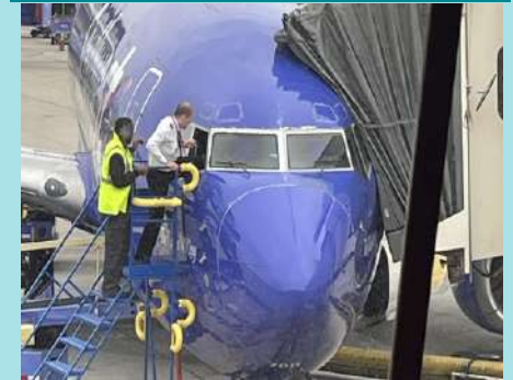
A Southwest pilot had to enter the cockpit from outside the Boeing 737.

A Southwest pilot was forced to enter through the cockpit Right side window after a passenger accidentally locked the flight deck door as he tried to use the lavatory during boarding on Thursday 25th May.