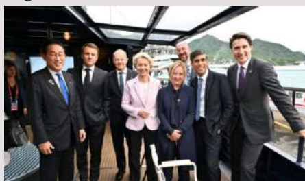
A PICTURE released by Japan's foreign affairs ministry recently shows (left to right) Japan's Prime Minister Fumio Kishida, France's President Emmanuel Macron, Germany's Chancellor Olaf Scholz, European Commission President Ursula von der Leyen, Italy's Prime Minister Giorgia Meloni, European Council President Charles Michel, Britain's Prime Minister Rishi Sunak and Canada's Prime Minister Justin Trudeau posing for a group photo as they travel by boat from Hiroshima to a nearby island during the G7 summit.

The US and Europe imposed financial penalties on Russia immediately following the start of the war last year and have steadily ratcheted up the pressure since then, targeting Putin and officials close to him, the financial sector and oligarchs.