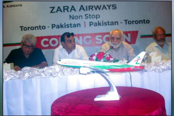
Zara Airways announces its flights from Canada to Pakistan