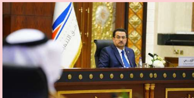
A handout picture released by Iraq's Prime Minister's Media Office shows Iraqi Prime Minister Mohamed Shia al-Sudani attending a meeting with transport ministry representatives in Baghdad on May 27, 2023. Iraq presented an ambitious plan to turn itself into a regional transportation hub by developing its road and rail infrastructure, linking Europe with the Gulf and other Middle East countries.

Iraq on Saturday 27th May presented an ambitious plan to turn itself into a regional transportation hub by developing its road and rail infrastructure, linking Europe with the Middle East.