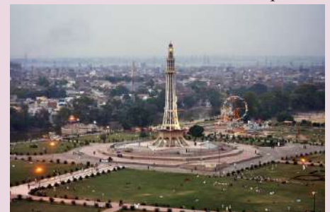
The “Tower of Pakistan” 1940 - Minar e Pakistan in Lahore.

To instill something so simple and natural seems to be a far cry, because we have digressed a little too far. To us all inspiration is still handy and in some cases, stored in our memories like sweets in a box -- the beauty of each one of it charming and magnificent. The former handy inspiration on chivalry and gentleness towards women is Prophet Muhammad's (PBUH) domain, as he is considered to be the best and first teacher of the world in Human behavior): standing up for women out of respect. Whenever his daughter Fatima used to arrive, Prophet Muhammad would stand up, greet her, and ask her to sit next to him and before him. When the Prophet used to leave for a travel, his daughter Fatimah was the last person he would say a farewell to, and she was the first one whom he visited upon his