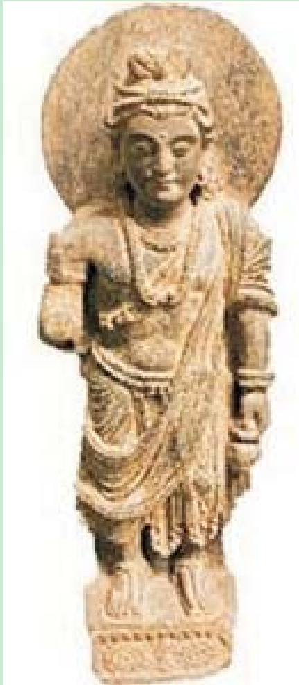
A 'Maitreya' idol that was returned to Pakistan.

More than 5,000 years' old figurines of the mother goddess from Mehrgarh were rescued from the basement of a New York art dealer. So was a relic showing Gautama Buddha meditating under the tree of awakening.