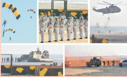
(Clockwise) Skydivers float to the ground with their parachutes deployed; the navy band plays traditional local and foreign tunes; a Sea King helicopter drops SSG commandos during a VIP rescue operation; uniformed officers climb aboard a navy hovercraft while a counter-terrorism drill is conducted by navy personnel on the beach.

The International Defence Exhibition and Seminar (IDEAS) 2022 Karachi Show at Nishan-i-Pakistan on Seaview beach provided a rare opportunity for local and foreign visitors to witness up close the swift tactical skills and maneuvers of the armed forces of Pakistan in the form of a joint demonstration here.