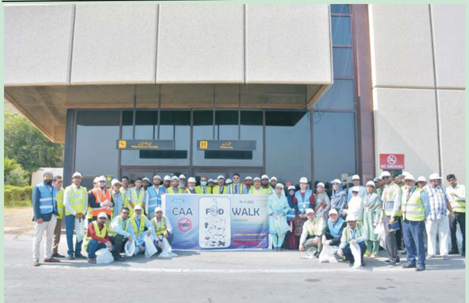
Pakistan Civil Aviation Authority (PCAA) holds cleanliness walk for the airports.

Although China remained committed to its stringent zero-Covid policy, it recently cut the quarantine period for overseas travellers to seven days plus three days of medical surveillance, according to South China Morning Post.