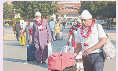
Indian Hindu pilgrims cross over to Pakistan to participate in the 314th birth anniversary celebrations of Shiv Avtari Satguru Sant Shadaram Shib at the historic shadani Darbar in Hayat Pitafi, at the Wagah border

On Dec 3, the pilgrims will return to India via Wagah border.