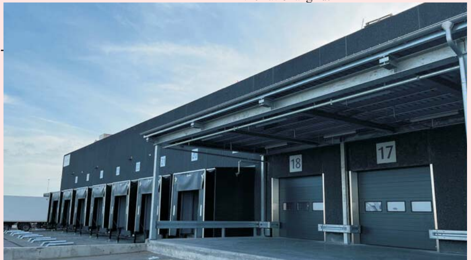
The new WFS Cargo Terminal 3 in Copenhagen

Earlier this year, WFS also entered a renewable energy partnership with NRGreen in Denmark to generate 100% of its power requirements by positioning 3,500 high efficiency solar panels across the roof area of WFS' cargo facilities at Copenhagen Airport. The establishment of the 1.4 MW solar power system the largest in the Greater Copenhagen area will provide an annual CO2 saving of up to 240 tons, the equivalent of a passenger car driving 57 times around the world. This is sufficient to power WFS' all-electric forklift and vehicle fleets and the LED lighting systems in its warehouse operations, and return surplus energy to the national grid.