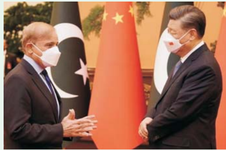
Prime Minister Shehbaz Sharif speaks with Chinese President Xi Jinping, prior to their talks at the Great Hall of the People, on Wednesday 2nd Nov.

Prime Minister Sharif strongly emphasised that Pakistan-China friendship enjoyed complete consensus across the political spectrum in Pakistan and was a model of inter-state relations.