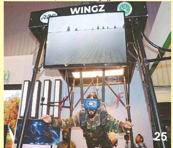
A security official experiences a virtual reality simulator on the final day of the 11th International Defence Exhibition and Seminar (IDEAS-2022), at the Karachi Expo Centre on Friday Nov. 18.