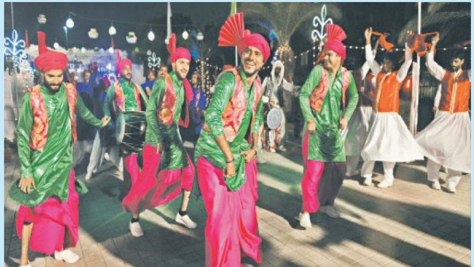
Dancers perform at the opening ceremony of the winter family festival at Racecourse Park.

He said that measures had been taken to formalise the PHA gardeners' services