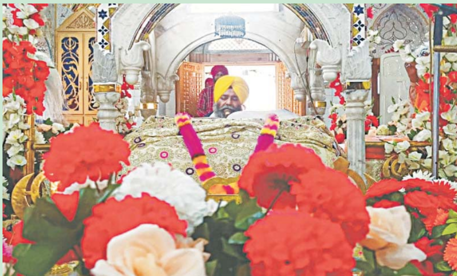
The concluding ceremony of 100-year celebrations of Saka Panja Sahib is under way at Gurdwara Panja Sahib on Sunday 30 Oct. Hundreds of Sikh pilgrims from India and other parts of the world travelled to Pakistan to participate in the event.

"When a mother comes with their children, they must be allowed to enter the park, because these children haven't seen anything good ... they must play and be entertained," she said. "I urged a lot to them, but they didn't allow us to get inside the park, and now we are returning home."