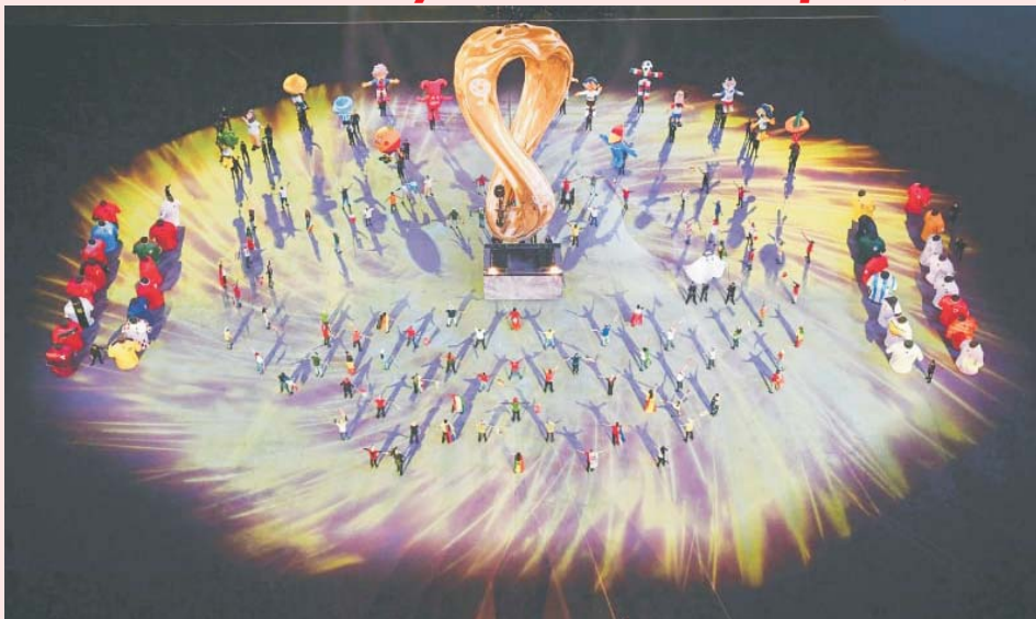
Dancers perform during the opening ceremony of the football World Cup at Al Bayt Stadium in Al Khor, Qatar.