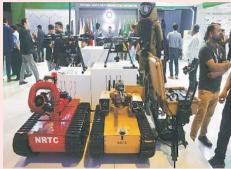
Visitors inspect different machines at IDEAS 2022 on the last day of the exhibition on Friday 18 Nov.