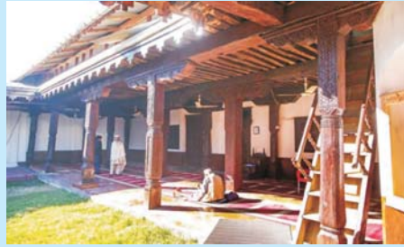
A view of ancient Chinar Jumat after restoration work.