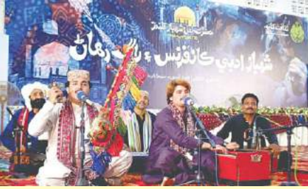
FOLK singers perform at the outset of the literary conference in Sehwan recently.

Speakers at a literary conference held in Sehwan have called for research on the life of Qalandar Lal Shahbaz and the historic importance of Sehwan.