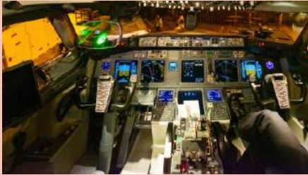
The cockpit of a Boeing 737-900ER.

We take a look at why there is a global practice of keeping cockpit doors open during boarding of a flight.