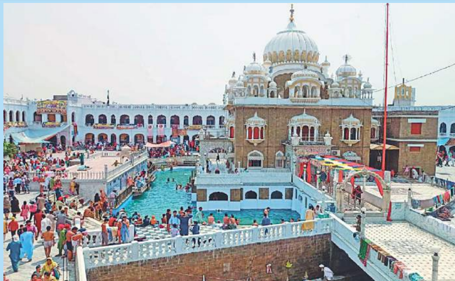
Pilgrims go about their routine at Gurdwara Punja Sahib Hassanabdal as Baisakhi festival celebrations began recently. Over 2,000 sikh from India are taking part in the festivities.