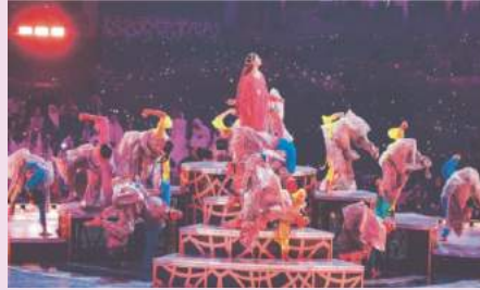
Dancers perform during the closing ceremony of Expo 2020 in Dubai on Thursday 31 March.

In 30 degrees Celsius (86 Fahrenheit) heat, long queues have formed at the most popular attractions, including the falcon-themed United Arab Emirates pavilion and the Saudi Arabia building, a slanted slab that appears to hover in the air.