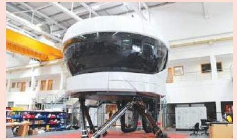
A view of the state-of-the-art Airbus A320 simulator which is being installed at Captain Abdullah simulator Complex in Karachi for the training of pilots.

Pakistan International Airlines (PIA) has acquired a state-of-the-art Airbus A320 simulator for pilot training, refresher courses and air safety.