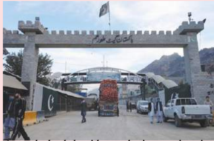
A truck loaded with goods is crossing into Afghanistan at the Torkham border.

Pakistan and Afghanistan met at the Torkham border to discuss the smooth flow of trade and pedestrians, largely as part of a scheme aimed at enhancing bilateral ties with the landlocked country.