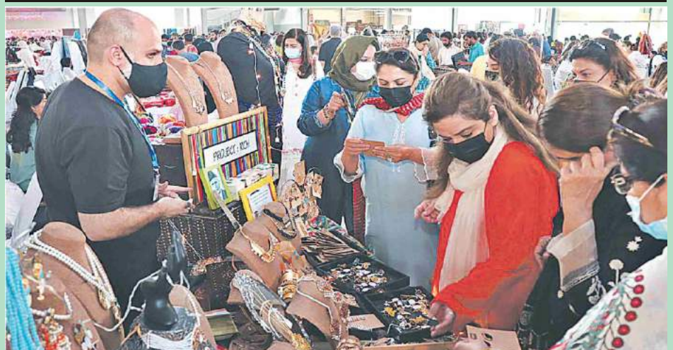
Visitors shop at the art and crafts exhibition organized the Dechi Foundation and the Lahore Chamber of Commerce and Industry at the Expo Centre. It showcased works by hundreds of artisans, entrepreneurs, business and cottage industry.