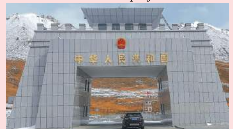
In this photograph taken on September 29, 2015, a car carrying Chinese nationals crosses the Pak-China Khunjerab Pass, the world's highest paved border crossing at 4,600 metres above sea level.

Gilgit Baltistan is considered the gateway of CPEC, and locals say it is important to open regular trade through Khunjerab Pass to ensure the success of the One Belt One Road project.