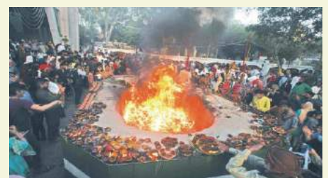
Devotees gather around a bonfire to light earthen lamps at the shrine of Sufi saint Madho Lal Hussain whose Urs celebrations began.