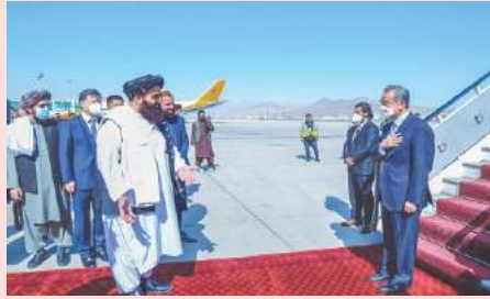
Acting Afghan Foreign Minister Amir Khan Muttaqi greets Chinese Foreign Minister Wang Yi at the airport on Thursday 24 March. The minister is the highest ranking Chinese official to visit Kabul since the Taliban takeover.

“Regional connectivity is an important element of our discussion with Afghan leadership and our way forward for our economic interaction with Afghanistan,” said Mansoor Ahmad Khan, Pakistan's envoy to Kabul, in an