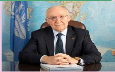
Salvatore Sciacchitano, ICAO Council President.

Regarding the inspection of digital health documents, Amendment 29 now requires countries to assist airlines in health proof evaluation to help deter fraud