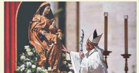
Pope Francis leads the Easter Mass at St Peter's Square on Sunday 17 April. Easter is one of the principal festivals in Christianity. It marks the Resurrection of Jesus Christ three days after crucifixion. For many churches, Easter is a joyful end to the Lenten season of fasting and penitence.