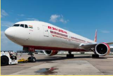
An Air India Boeing 777-300ER in Washington D.C.

A ir India failed a recent safety audit at Delhi Airport, prompting the Directorate General of Civil Aviation (DGCA), Indian aviation's regulatory body, to make the decision to prohibit the airline from transporting any goods deemed "dangerous" to the city for 15 days. The airline failed to pass an audit measuring its compliance with ICAO guidelines, prompting the decision. The prohibition will be in effect from April 7 to April 23.