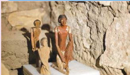
A statuette and other artifacts are pictured inside one of the five ancient Pharaonic tombs recently discovered at the Saqqara archaeological site.

Egypt unveiled on Saturday 19 March five ancient Pharaonic tombs at the Saqqara archaeological site south of Cairo, the latest in a series of landmark discoveries in the area.