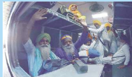
Sikh devotees who came from India to attend the Baisakhi festival wave from their train compartment at Lahore Railway station recently.

In a bid to facilitate a number of Sikh pilgrims arriving in Lahore from India via Wagah, the Pakistan Railways (PR)