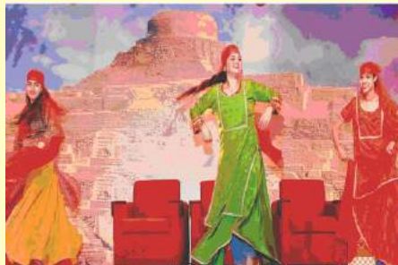
A Mesmerising dance performance is put up during one of the events at the Sindh Literature Festival.

He said history had a proof that Qalandar belonged to Marwand, an area in Azerbaijan. That point should form basis for research on him, he said.