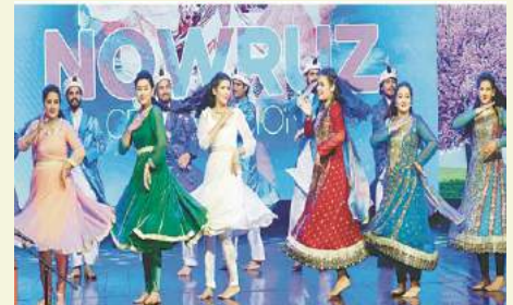
Artists perform during a ceremony in connection with Nowruz at PNCA.