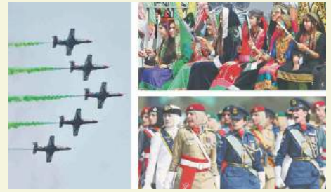
The Sherdils fly in formation during an aerial demonstration at the Pakistan Day parade; children dressed in traditional attire wave flags from the float of Khyber Pakhtunkhwa province; and women from various branches of the armed forces march as part of the military parade.

A traditional chador was presented to FCCI President Sheikh.