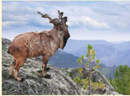
The Trophy Hunting Programme was designed to reduce illegal hunting of endangered wildlife and has led to an increase in markhor populations in the north of Pakistan

The former princely states of Chitral, Swat, Dir and the Malakand Agency, and erstwhile tribal areas that have had a forbidden past and an uncertain future, are discussed in part two, titled 'Romance of the Frontier'. This section takes us to the past of tribal areas, from early visitors to modern visitors and dignitaries, the tribesmen and their motivations, the tribal institutions and what makes these areas as