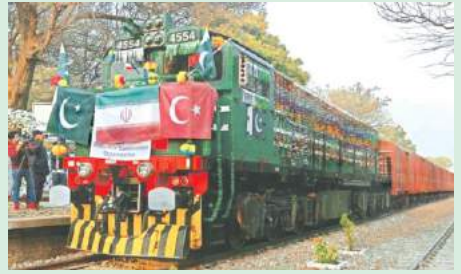
THIS file photo shows the first Islamabad-Tehran-Istanbul freight train at Margalla Railway Station in Islamabad during the inauguration ceremony on Dec 22, 2021.

T he fourth Islamabad-Tehran-Istanbul (ITI) freight train carrying various high-value products in six containers has departed from Pakistan for Turkey.