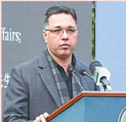
STATE Minister and BoI chairman Azfar Ahsan.

Pakistan and Uzbekistan have agreed to evolve a joint 'roadmap' which includes measures to develop a feasibility study for