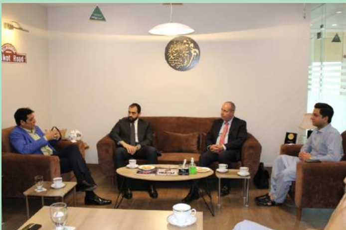
View of the meeting.